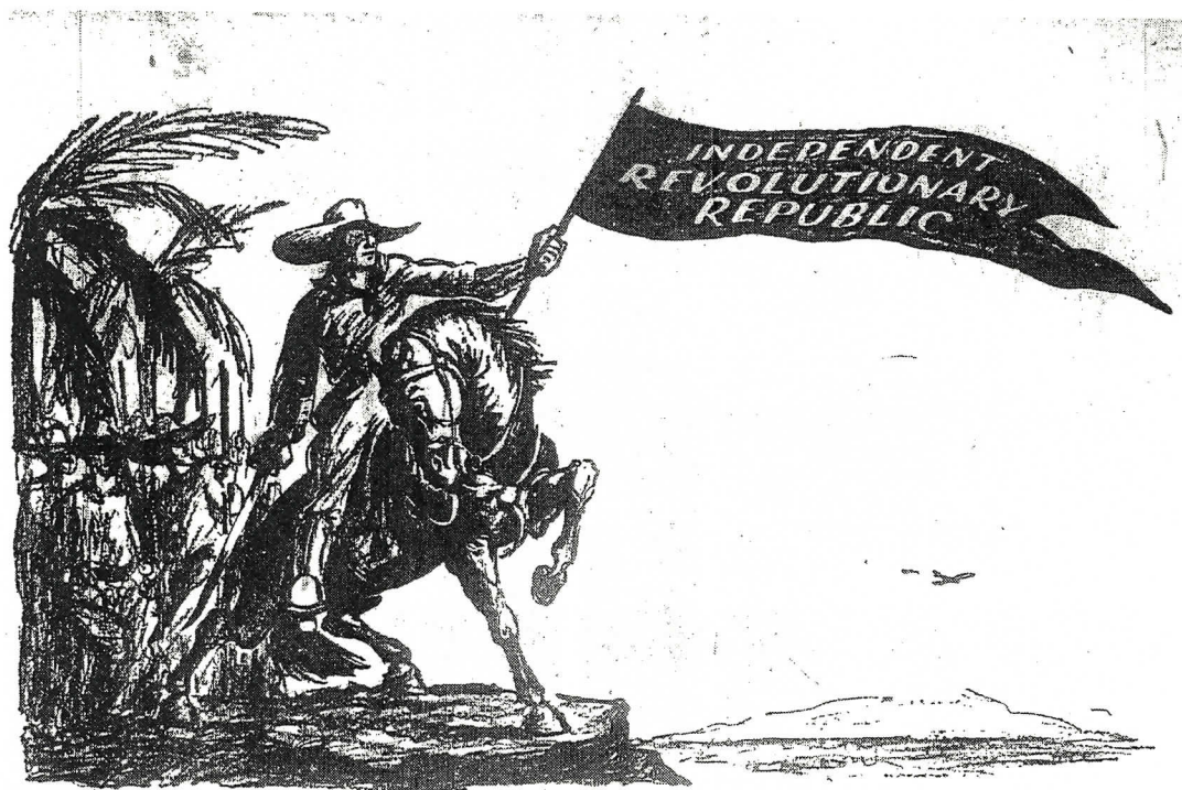
ILLUSTRATION 6: 'Viva Nicaragua Libre! Nicaragua shall not be the patrimony of imperialists and traitors, and I shall fight them as long as my heart beats': General Sandino. The Daily Worker , 7 Jan. 1928.