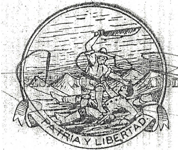
ILLUSTRATION 3: Two Versions of the Official Seal of the Defending Army of Nicaraguan National Sovereignty, June 1927 and June 1930.