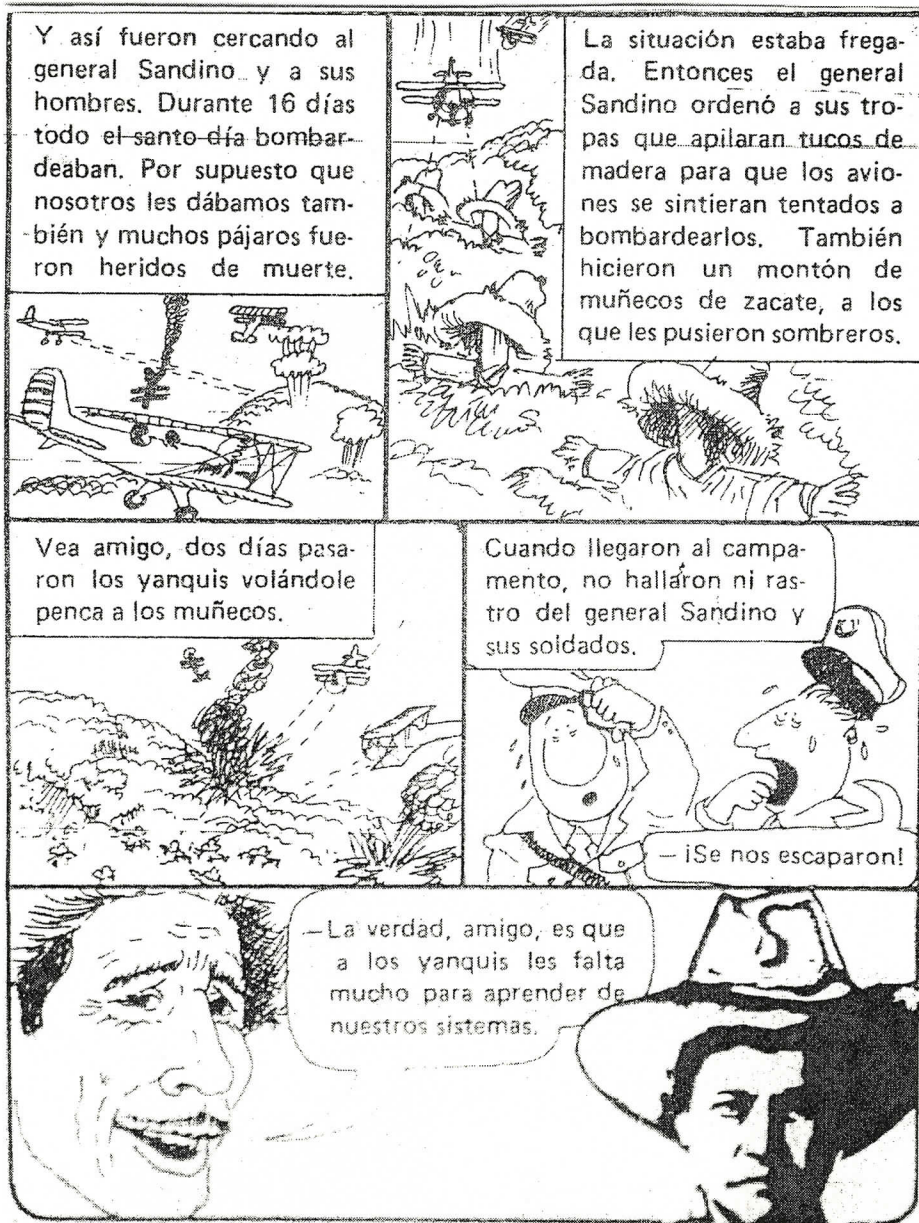
ILLUSTRATION 4: Detail of 'Un Engaño Genial' ('An Inspired Deception'). Barricada, 7 Aug. 1983.