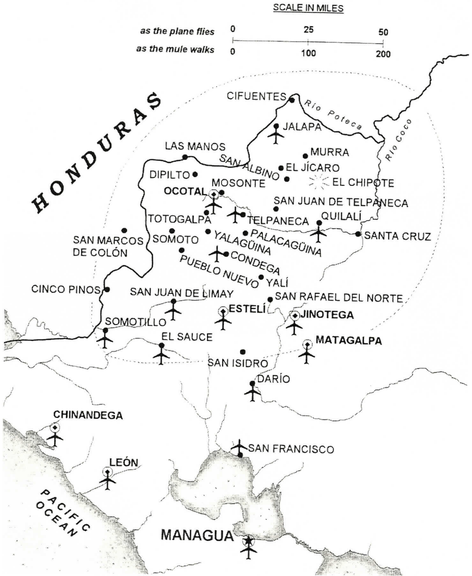
ILLUSTRATION 2: Map of Las Segovias, Nicaragua, and Adjacent Zones, Showing Airfields Built 1927-34. Michael J. Schroeder.