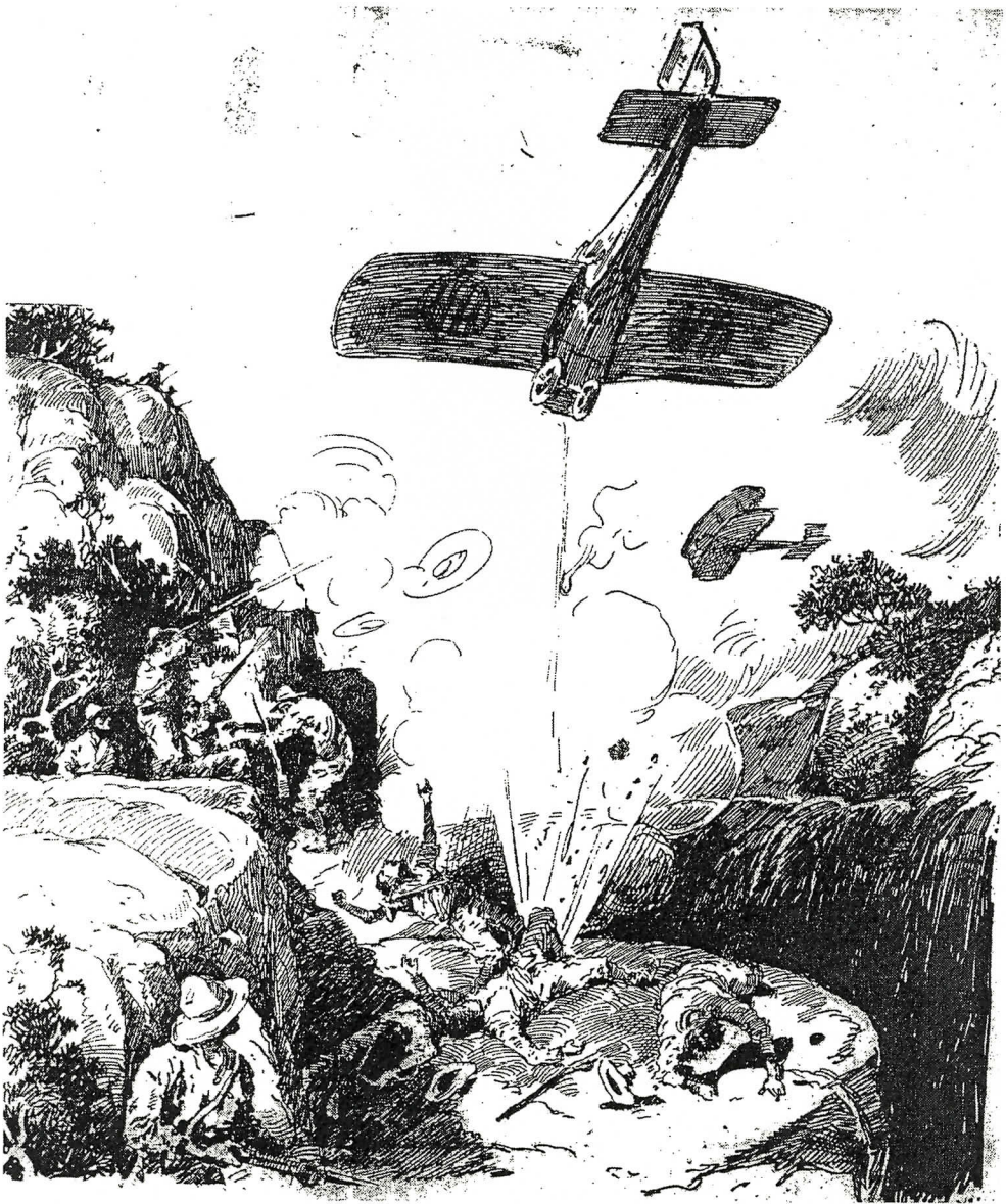
ILLUSTRATION 5: 'Unequal, anguished struggle of Nicaragua can only be waged with the courage of patriots like Sandino'.