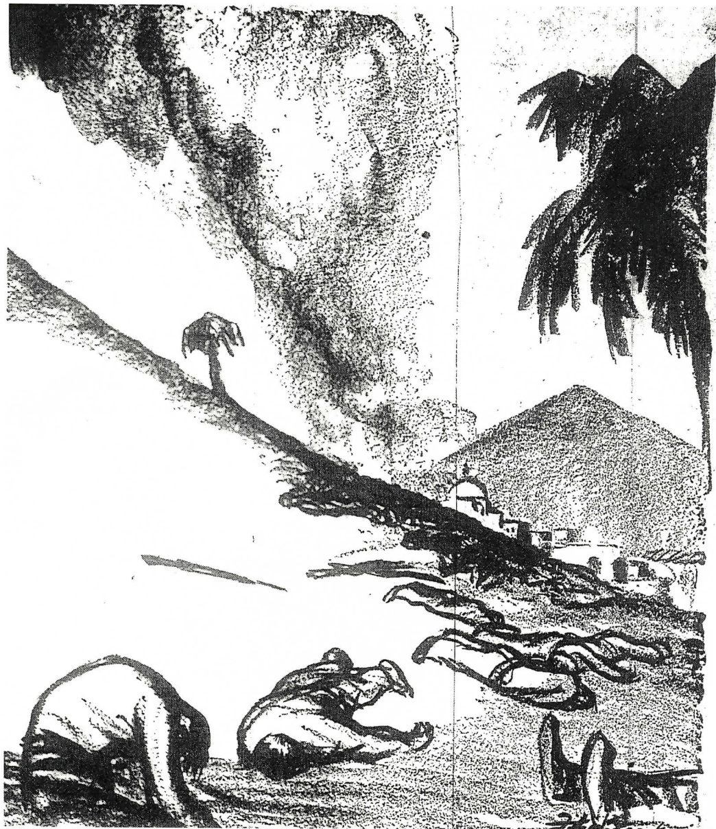
ILLUSTRATION 1: 'The Black Hills of Nicaragua'. St Louis Post-Dispatch , 24 July 1927. Reprinted with permission of the St Louis Post-Dispatch , copyright 1927.